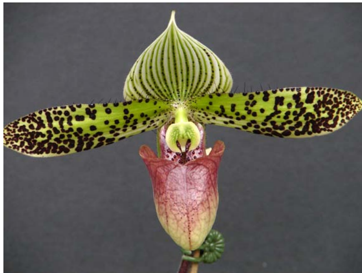
Margi Brannan's Photo