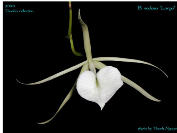
B. nodosa 'Largo'

Directions to their home will be provided at the October meeting.